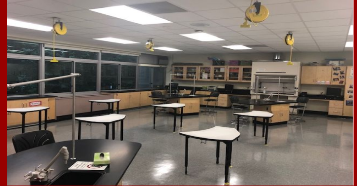
Room 201 - Grade 8 Classroom Cohort