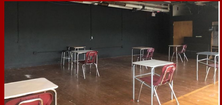
STAGE - Reading & Special Education Services