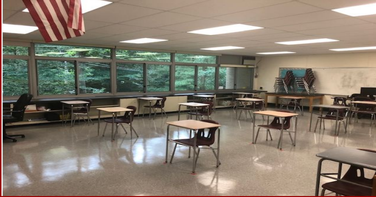
Room 104 - Grade 6 Classroom Cohort