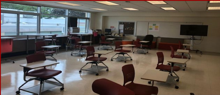
Room 108 - Grade 6 Classroom Cohort